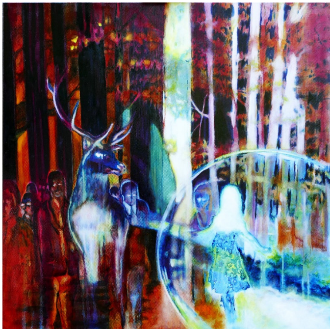
Tatjana Deutschmann, Black Forest, Acrylic on Canvas, 100x100 cm