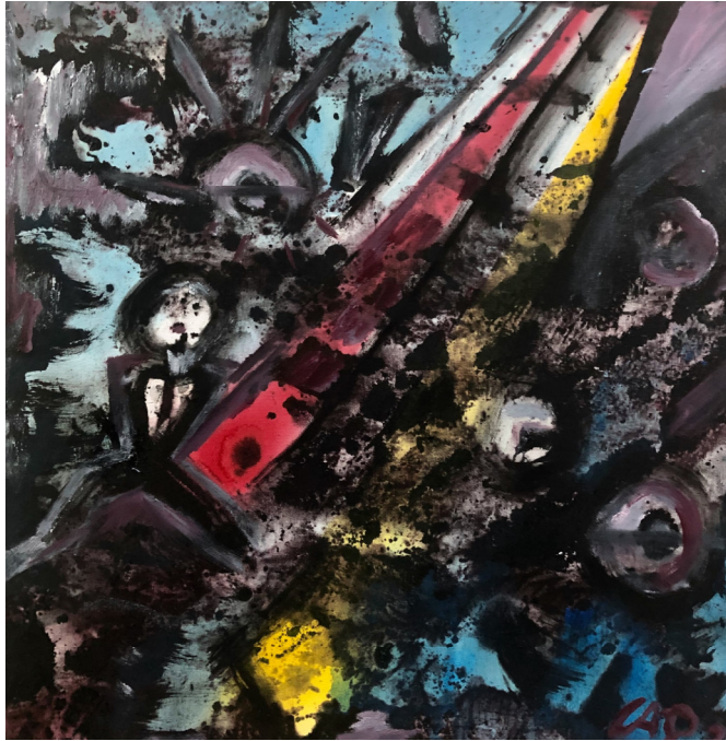
Carlos A. Duro, Girl on Rocket, Oil, Chinese Ink on Canvas, 40x40 cm

Carlos A. Duro's expressionistic paintings are individual universes of dynamic brush strokes in Chinese and Japanese ink and acrylic colours on paper and canvas. The German artist is living and working in Leonberg and Buriyam, Thailand. His current series, among them „Girl on Rocket“ is exploring the polarity between darkness and light, silence and noise, a story of power and passion in all its multilayered complexity.